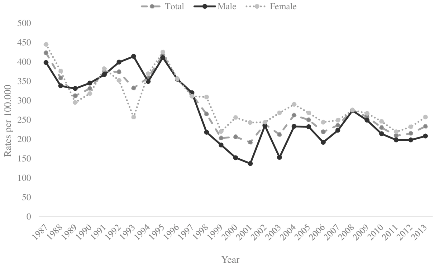
Fig 1. Self-harm (person based) rates in Ghent 1987–2013.